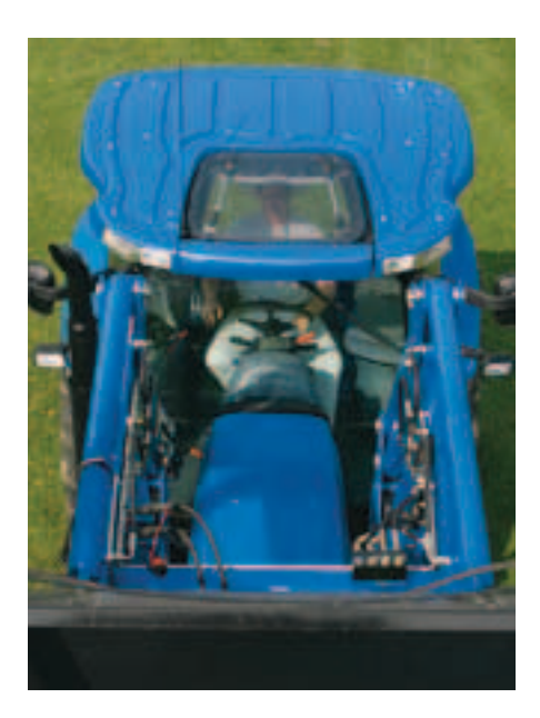
The Horizon<sup>™</sup> cab features an optional high-visibility roof panel for an easy view to a raised loader bucket.

For the absolute smoothest ride over bumpy ground, choose the Comfort Ride™ Cab Suspension option available on Plus and Elite models. This simple mechanical system is always on. Two isolation "donuts" at the front corners of the cab and a swaybar and two shock absorbers at the rear isolate you from up-down motions and side-to-side swaying.