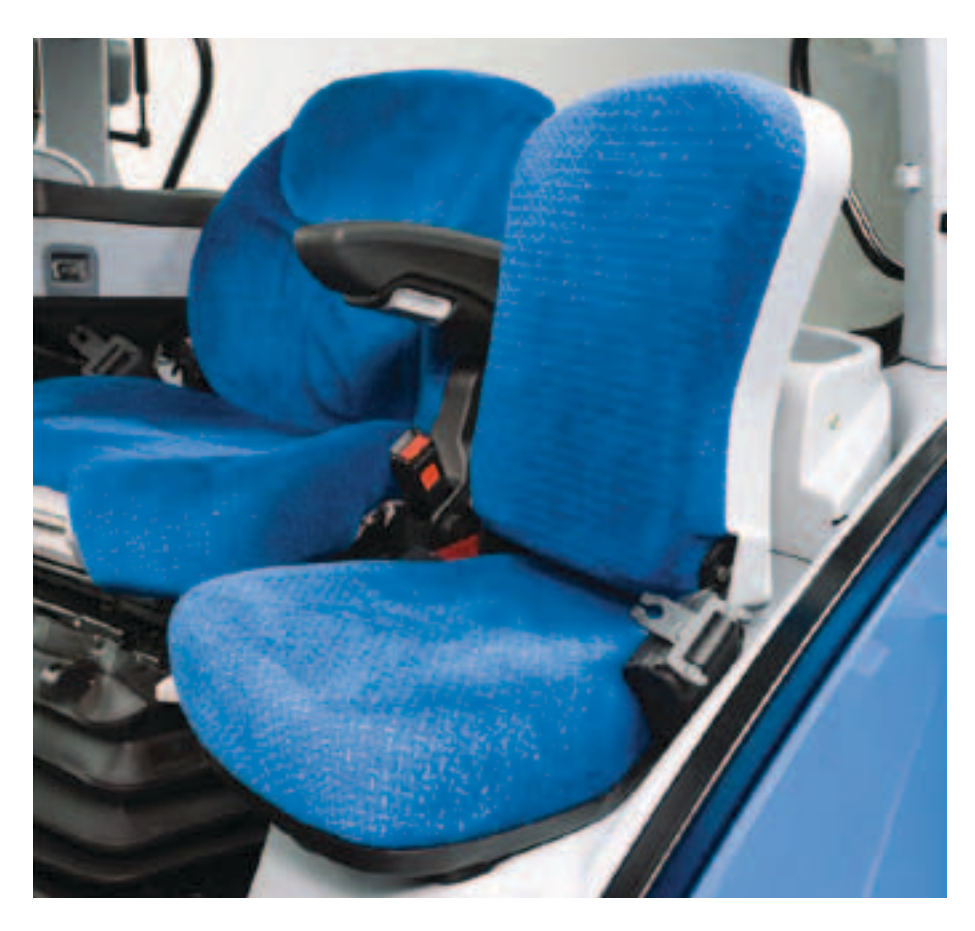
A comfortable, supportive, full-size instructor seat is a Horizon<sup>™</sup> cab option.

cab also features heated electronic external mirrors and a speaker upgrade.