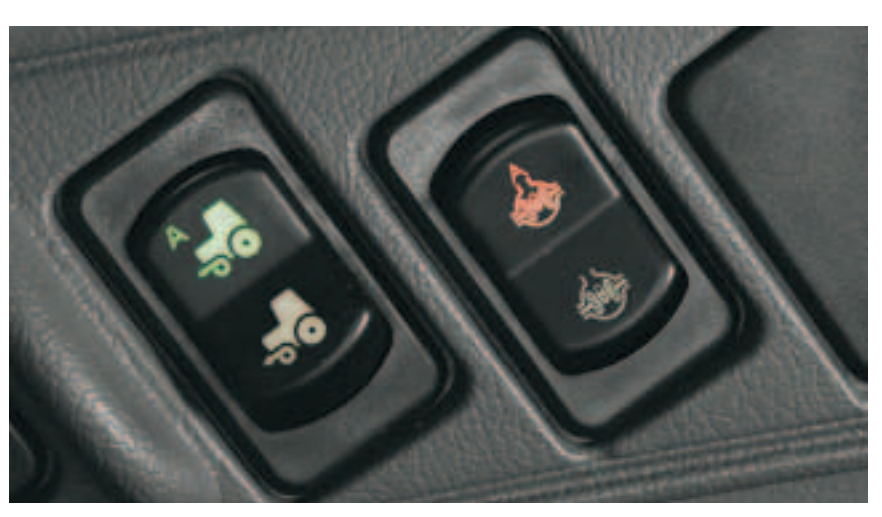
The Terralock™ system automatically controls FWD and differential lock engagement to give you maximum traction and control.

Self-adjusting, self-equalizing hydraulic wet disc brakes deliver the stopping power you need. When both brake pedals are applied simultaneously, FWD engages automatically to aid in braking action for added control.