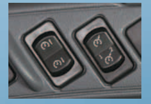
Push buttons for constant rpm and cruise control.