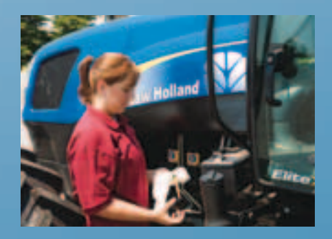
You can check the oil without raising the hood.